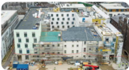
Premier Inn Hotel, Cork City

Our success is built on our established reputation for manufacturing and supplying high quality construction materials, matched only by our commitment to providing the highest standards of service.