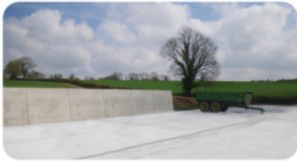
Agri Construction Project, Innishannon