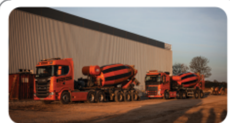
Large-Scale Logistics Warehouse, Little Island

Keohane Readymix was contracted by Summerhill Construction to supply the aggregates, blocks and large pours of readymix concrete required for construction of this large-scale logistics warehouse in Courtstown, Little Island, Co. Cork.